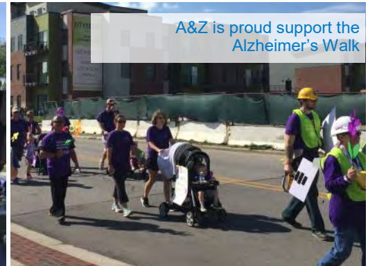
A&Z is proud support the Alzheimer's Walk

continued teaming article from front page... Ultimately, this teaming benefits our clients, the partnering firms, and employees. It's a win-win all around!"