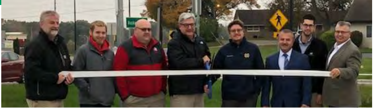
Warsaw and A&Z officials gather to celebrate the Husky Trail Road Project on November 1